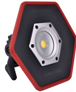
LUMENATOR® Sr MXN05400 Order MXN05401 for light with magnet