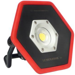
LUMENATOR® Jr MXN05200 Order MXN05201 for light with magnet